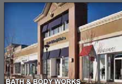
BATH & BODY WORKS