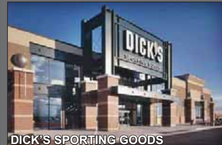
DICK'S SPORTING GOODS