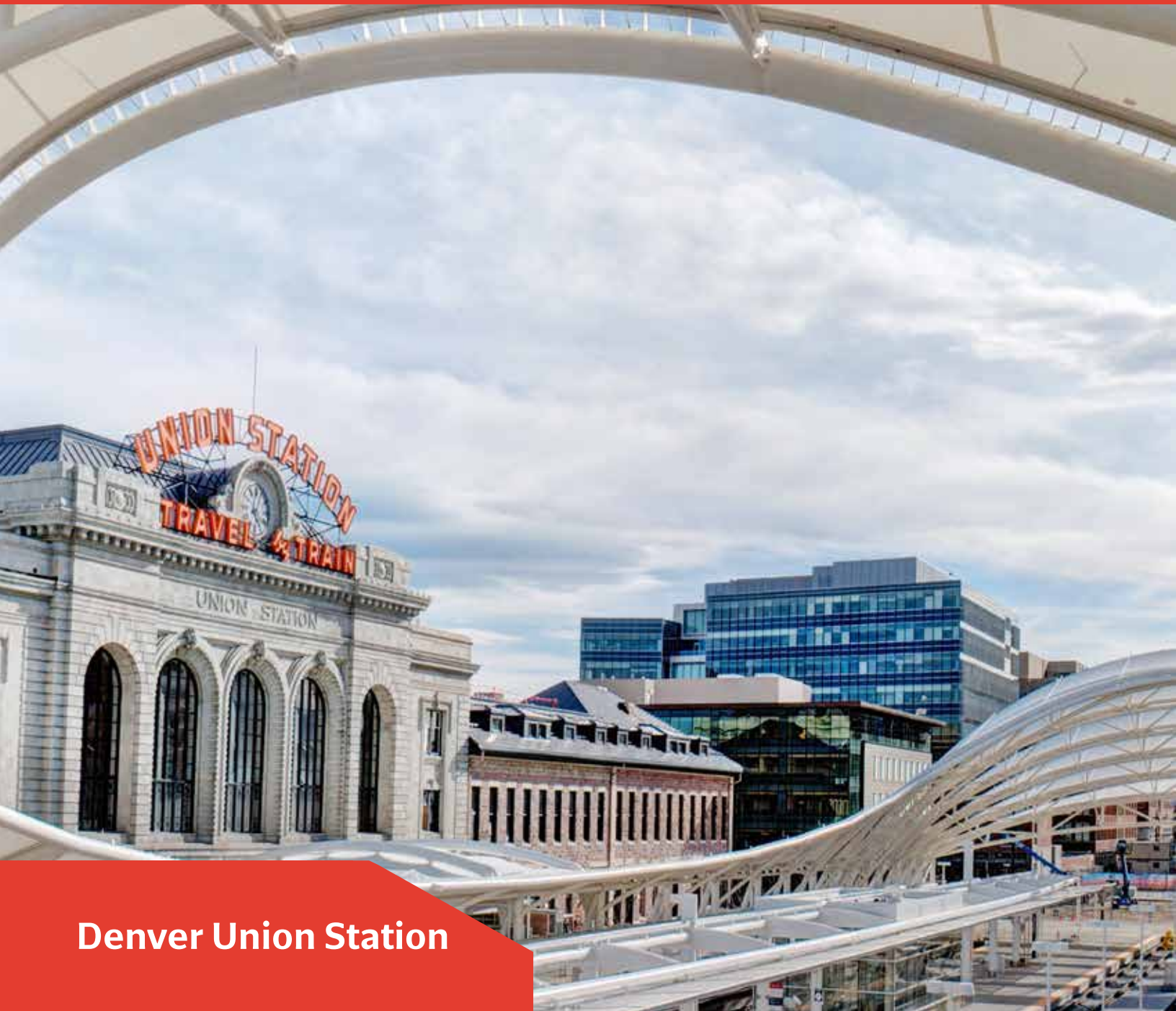
Denver Union Station